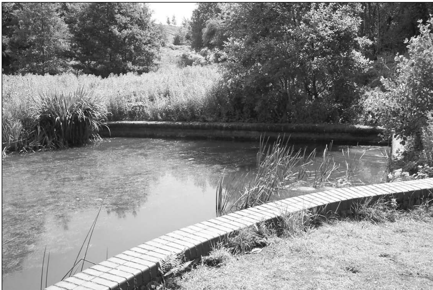
The Canal Basin at Granville Country Park