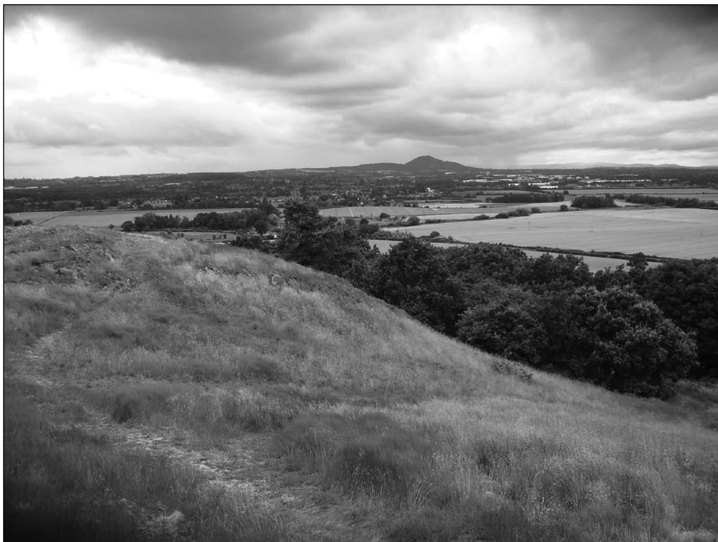
View of the Parish from Lilleshall Monument towards the Wrekin